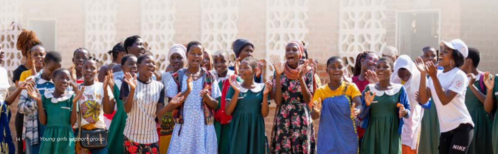
14 Young girls support group