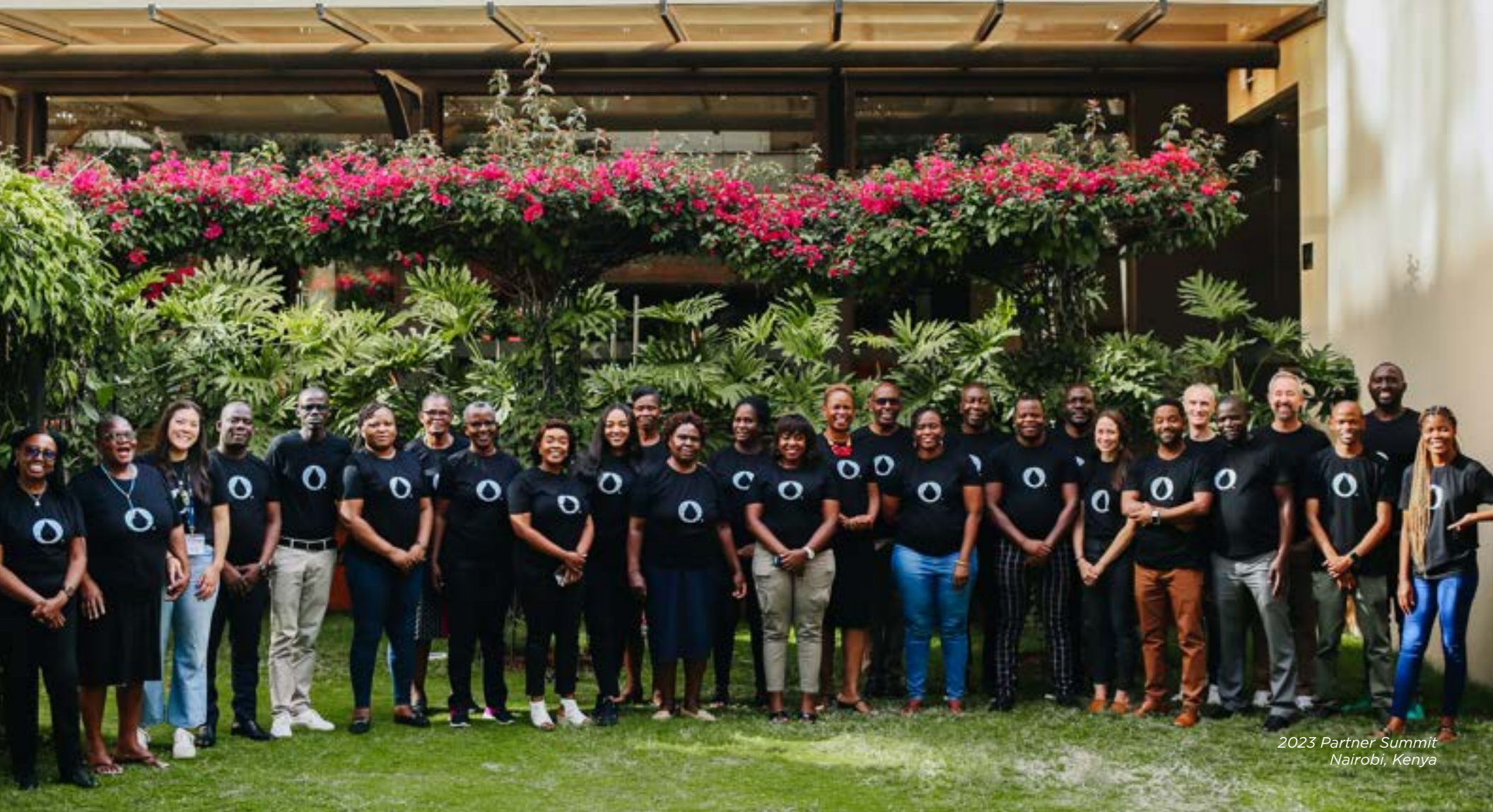
2023 Partner Summit Nairobi, Kenya