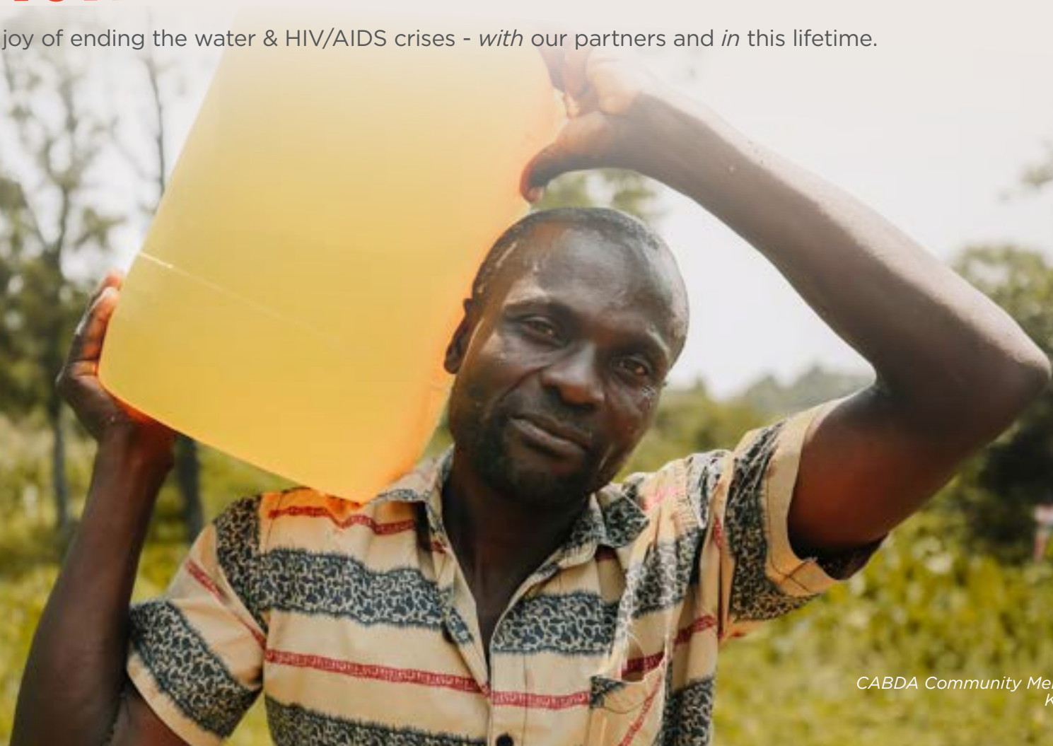
CABDA Community Member Kenya

To share in the joy of ending the water & HIV/AIDS crises - with our partners and in this lifetime.