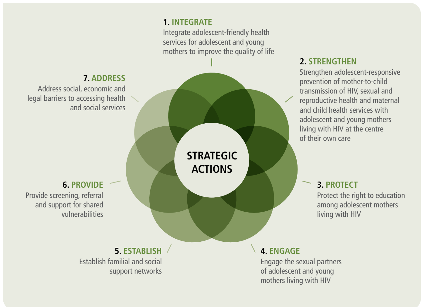
Fig. 1.4. Key strategic actions for improving services for young mothers living with HIV

services, communities, families and adolescent and young mothers are working together to bridge the gap between adolescent- and adult-focused HIV and maternal health services. Whilst outcome data are not as robust in general, the programme examples provided here serve to highlight potential and ongoing lessons in countries.